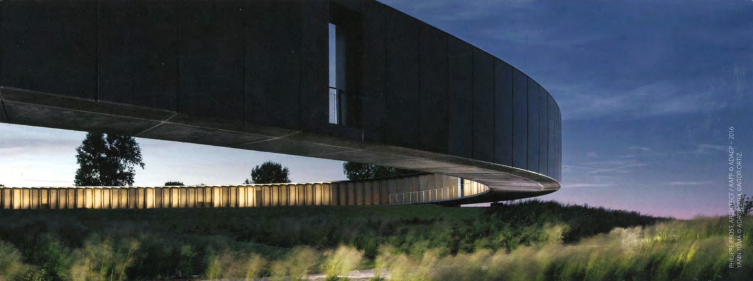
PHILIPPE PROST, ARCHITECT / AAPP © ADAGP - 2016 YANN TOMA © ADAGP / PHILIPPE PROST